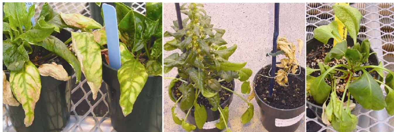
Fig. 2. Symptoms of Verticillium wilt of spinach after early initiation of bolting (left) and seed set (center: left plant noninoculated, right plant inoculated) resulting from seed transmission of Verticillium dahliae , and symptoms of Fusarium wilt of spinach (right) resulting from seed transmission of Fusarium oxysporum f. sp. spinaciae . Note the interveinal chlorosis and wilting of the oldest leaves on plants infected with Verticillium wilt versus general wilting of the entire plant and a lack of distinct interveinal chlorosis on the oldest leaves for the plant infected with Fusarium wilt.