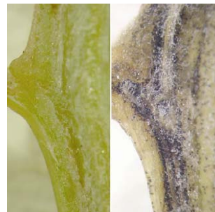
Fig. 4. Longitudinal section of the stem of a spinach plant not inoculated (left) or inoculated (right) with Verticillium dahliae by dipping the root plug in a spore suspension of the fungus prior to transplanting. Note abundant microsclerotia in the vascular tissue of the inoculated plant, observed 5 days after incubation of the inoculated plant in a moist chamber following surface-sterilization in 0.5% NaOCl for 5 min.

Root rot and pale brown discoloration of the vascular tissues in the roots, crown,