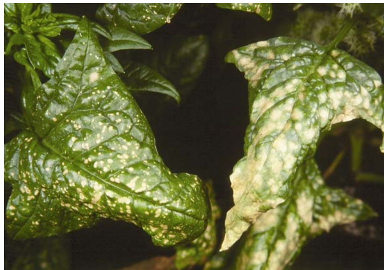
Fig. 2. Symptoms of Cladosporium leaf spot (left) and Stemphylium leaf spot (right) approximately 3 weeks after inoculation of spinach plants with Cladosporium variabile and Stemphylium botryosum , respectively. Cladosporium leaf spots are small with discrete margins compared with the larger, diffuse lesions of Stemphylium leaf spot.

Development of S. botryosum and C. variabile on spinach seed. Using the